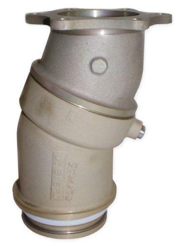
D-3 Inlet Coupling Shown in D-2 straight inlet configuration

Older Model 64349 nozzles (D-1 or D-2) may be badly worn at the body swivel joint and it may not be possible to get a leak tight fit with the new D-3 universal coupling. Model 64349 nozzles with serial numbers 8200 and higher include a replaceable wire ball race ring and can safely be retrofitted with the D-3 inlet (after inspection of the wear ring to determine if replacement is needed). Eaton does not recommend retrofitting any Model 64349 nozzle that does not have a replaceable wire ball race ring in its inlet.