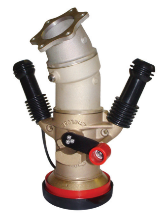
Model 64201N Shown in D-1 45° configuration