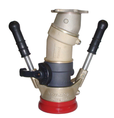
Model 64349N Shown in D-2 straight inlet configuration